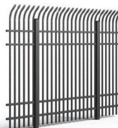
UAD 100 DEFENDER SPEAR TOP Defender security fence with angled spear top pickets