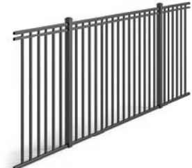
UAB 200 FLAT TOP FLUSH 4' H x 6' W, 3-Rail