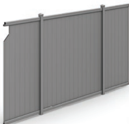
ULTRA ALUMINUM™ PRIVACY FENCE ALL ALUMINUM 6' wide x 4', 5' and 6' High Sections

It's the ideal privacy panel for a residential, commercial or industrial application, as patio or balcony screening, to contain or shield air conditioning equipment, dumpsters, pipes, and electrical systems. Ultra Aluminum™ Privacy fencing is designed to last for years and years without the worry of ongoing maintenance.*