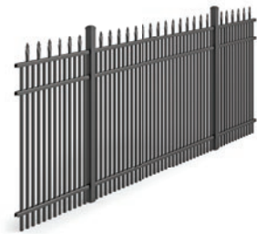
UAS 101 SPEAR TOP With 1-5/8" spacing residential and 1-1/2" spacing commercial