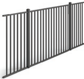
UAF 200 FLUSH 4' H x 6' W, 2-Rail