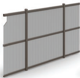
ULTRA™ VINYL PRIVACY FENCE ALUMINUM+VINYL Aluminum Frame for Tongue and Groove Vinyl Inserts