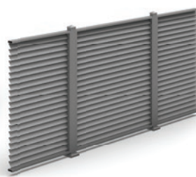
ULTRA™ LOUVERED PRIVACY FENCE Aluminum Frame and Louvers