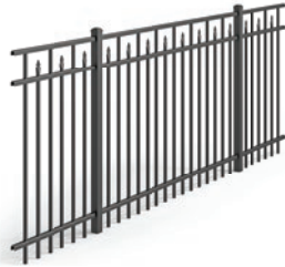
UAF 250 FLAT TOP W/SPEAR 3-Rail fence with spear top pickets between mid and top rail