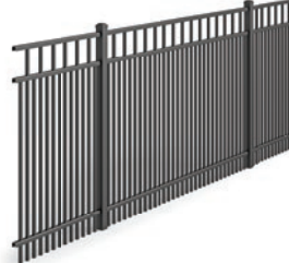
UAF 201 FLAT TOP With 1-5/8" spacing residential and 1-1/2" spacing commercial