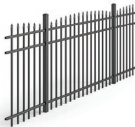
UAS 350 CONVEX SPEAR TOP 3-Rail fence with spear top pickets in convex formation above top rail