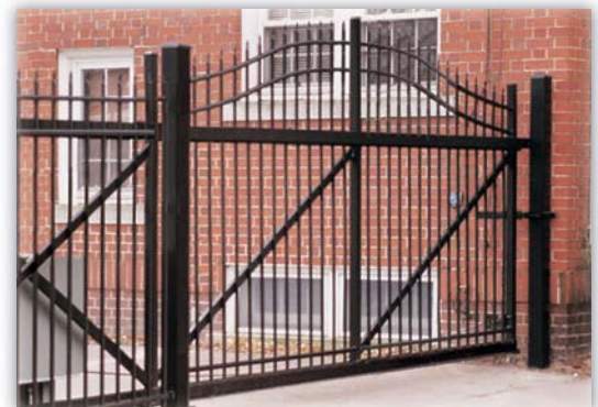
Industrial Series Cantilevered Estate Gate