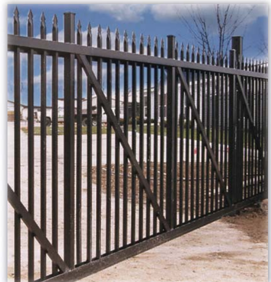
Industrial Series Cantilever Gate