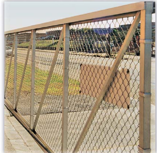
Industrial Series Mill Finish Cantilever Gate