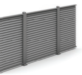
ULTRA<sup>™</sup> LOUVERED PRIVACY FENCE Aluminum Frame and Louvers