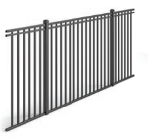
UAB 200 FLAT TOP FLUSH 4' H x 6'W, 3-Rail