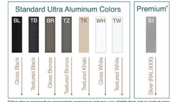
Colors shown represent an approximate comparison and may vary slightly from actual product color. Premium Colors are available at an extra charge and may require additional lead times. Ask your Ultra Representative for details.

*Ultra Aluminum™ Privacy fencing comes in standard Textured Black (TB), Textured Bronze (TZ), Textured Khaki (TK), Textured White (TW) and Premium Silver (SI).