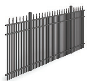
UAS 101 SPEAR TOP With 1-5/8" spacing residential and 1-1/2" spacing commercial