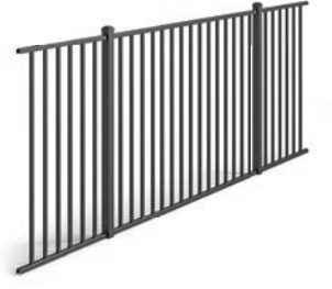
UAE 200 FLUSH 4' H x 6' W, 2-Rail