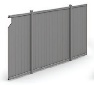
ULTRA ALUMINUM™ PRIVACY FENCE ALL ALUMINUM 6' wide x 4', 5' and 6' High Sections

It's the ideal privacy panel for a residential, commercial or industrial application, as patio or balcony screening, to contain or shield air conditioning equipment, dumpsters, pipes, and electrical systems. Ultra Aluminum<sup>™</sup> Privacy fencing is designed to last for years and years without the worry of ongoing maintenance.*