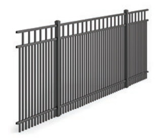
UAF 201 FLAT TOP With 1-5/8" spacing residential and 1-1/2" spacing commercial