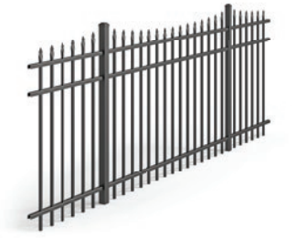
3-Rail fence with spear top pickets in concave formation above top rail