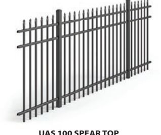
3-Rail fence with spear top pickets above top rail