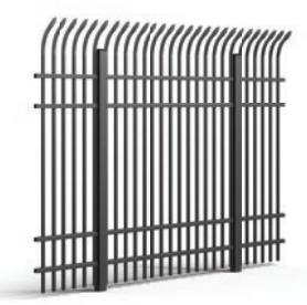
UAD 100 DEFENDER SPEAR TOP Defender security fence with angled spear top pickets