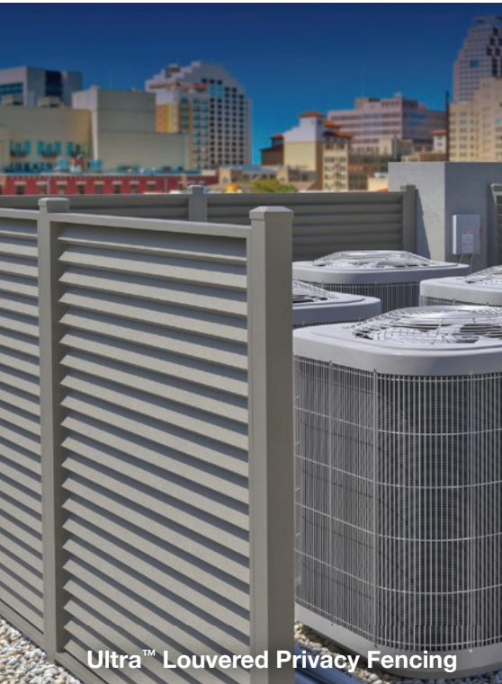
Ultra™ Louvered Privacy Fencing

It's the ideal privacy panel for a residential, commercial or industrial application, as patio or balcony screening, to contain or shield air conditioning equipment, dumpsters, pipes, and electrical systems. Ultra Aluminum™ Privacy fencing is designed to last for years and years without the worry of ongoing maintenance.