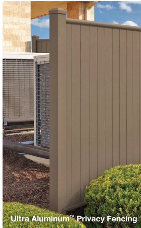
Ultra Aluminum™ Privacy Fencing

Ultra™ Louvered Privacy, with welded aluminum louvers, are offered in 6' wide by 4', 5' and 6' high sections, and can be fashioned into single, double or drive gates.