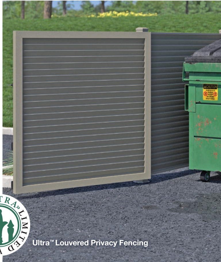
Ultra™ Louvered Privacy Fencing