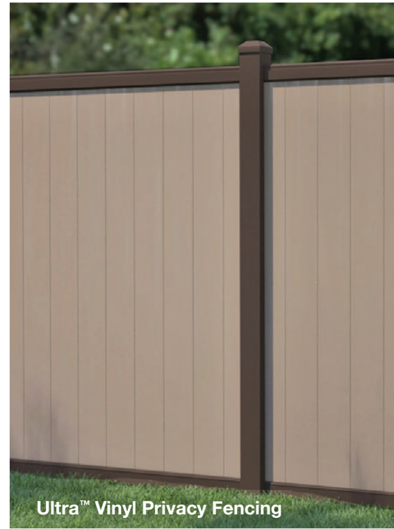
Ultra™ Vinyl Privacy Fencing

An all-aluminum privacy fence with a Limited Warranty. As strong as steel, but will never rust. Ultra Aluminum™ Privacy won't rack and wobble. It is designed to last for years and years without the worry of ongoing maintenance.