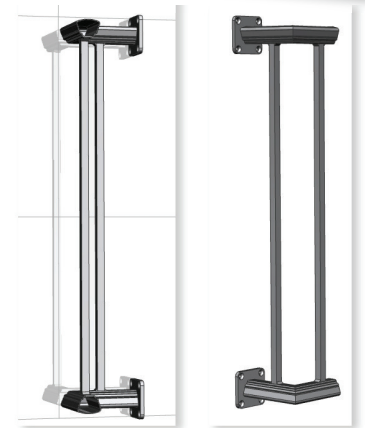
3/4 inside View