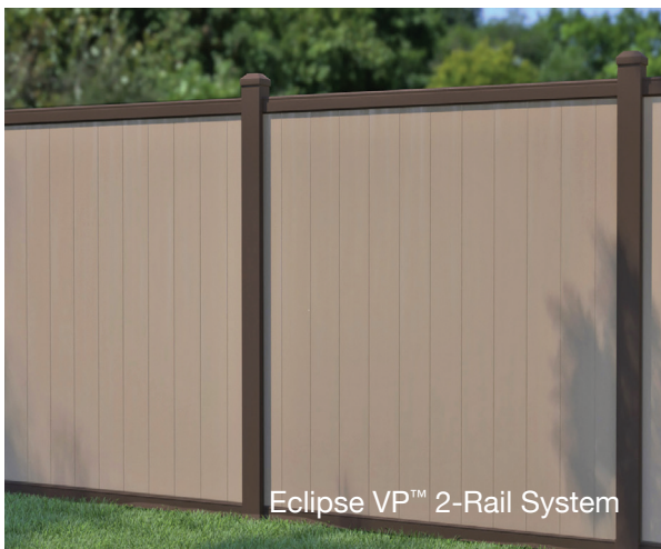
Eclipse VP™ 2-Rail System

Note: The 3-Rail System is recommended for variegated and darker vinyl insert colors.