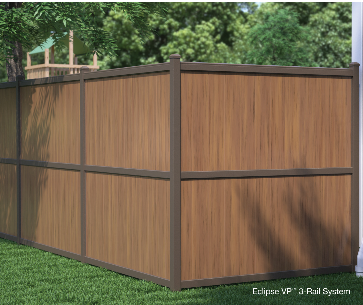
Eclipse VP™ 3-Rail System

This beautiful new low-maintenance privacy fence combines the strength of extruded aluminum top, middle and bottom rails to be combined with rich solid or variegated-color vinyl panel inserts.